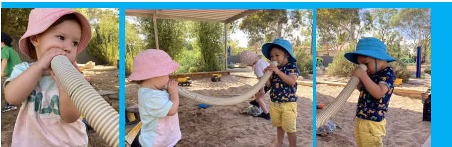
Investigating sound tubes in the sandpit.

Woodwork was so much fun that we ran out of wood!